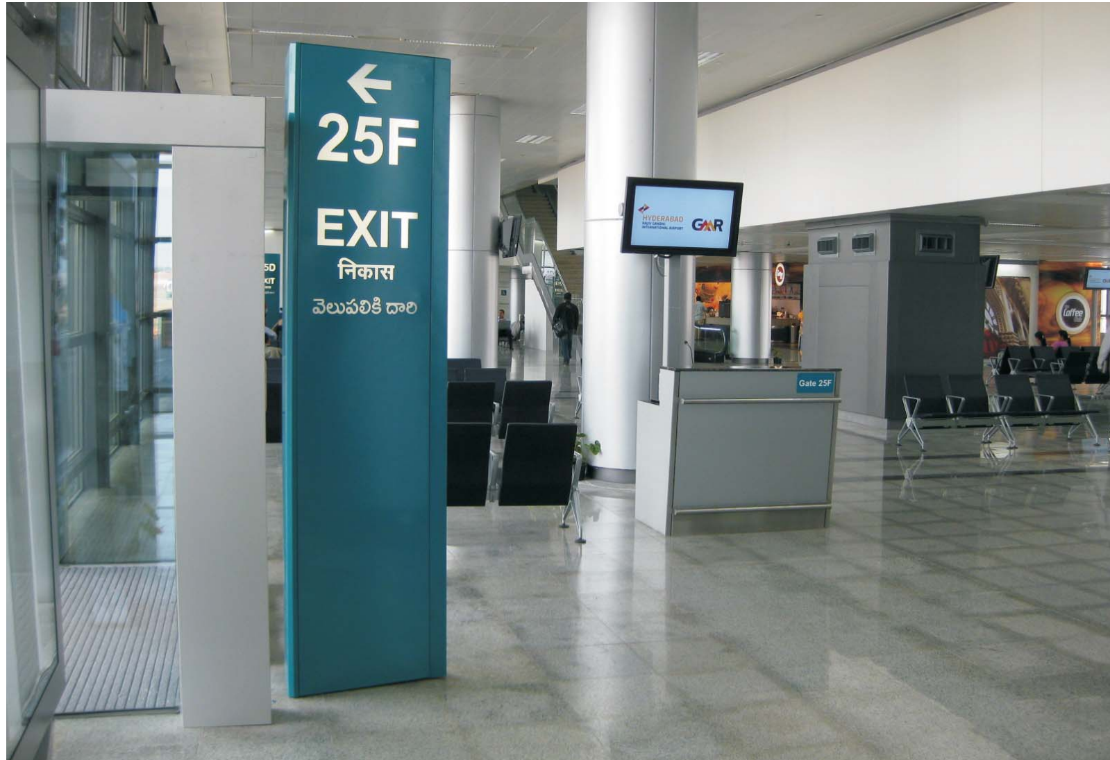
20 Gates positions with FIDS monitor and triangular pilon sign