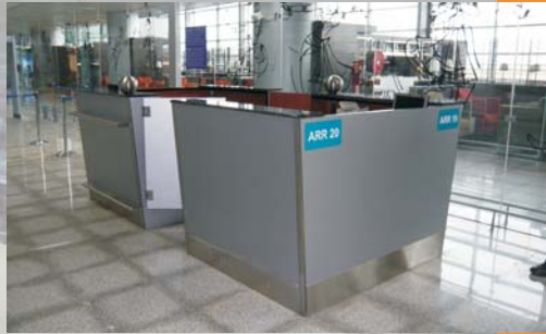
Airport Village viewed from Departure Level

Hyderabad International Airport Limited (HIAL) has developed this International Airport, jointly promoted by the GMR Group and Malaysia Airports Holdings Berhad, with public participation from Airports Authority of India and Government of Andhra Pradesh. NKI group designed, produced and installed all interior works and a complete terminal signage system.