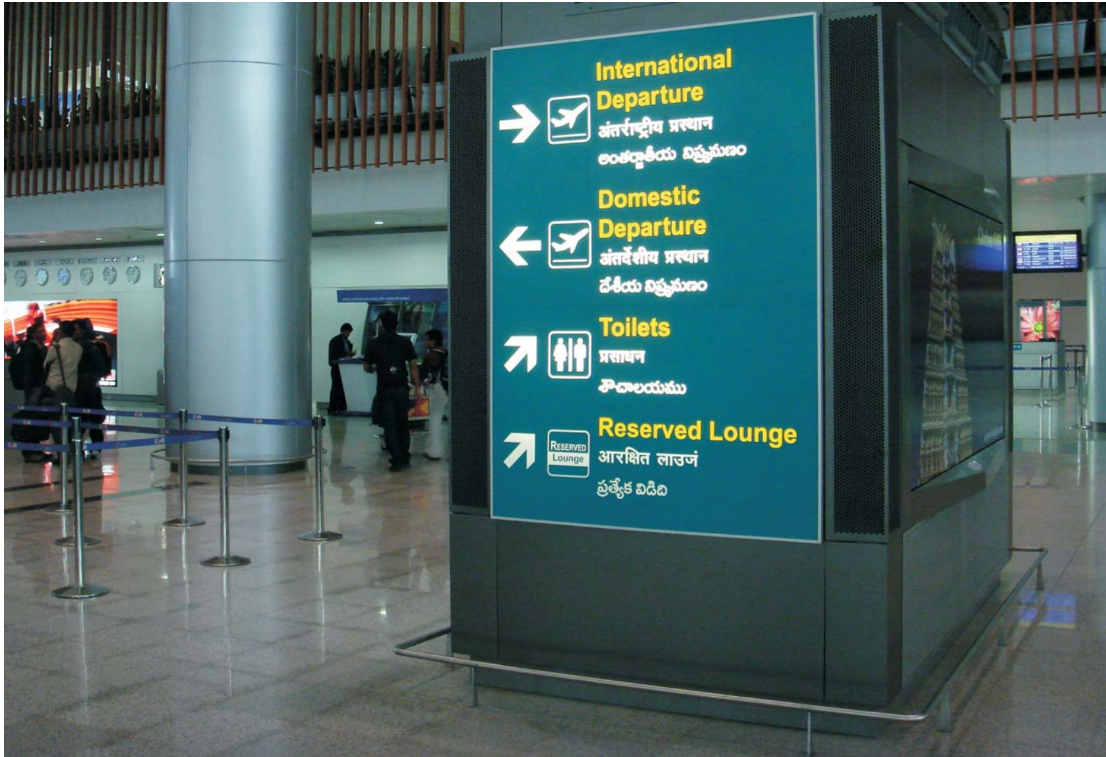
Wall mounted integrated way finding sign